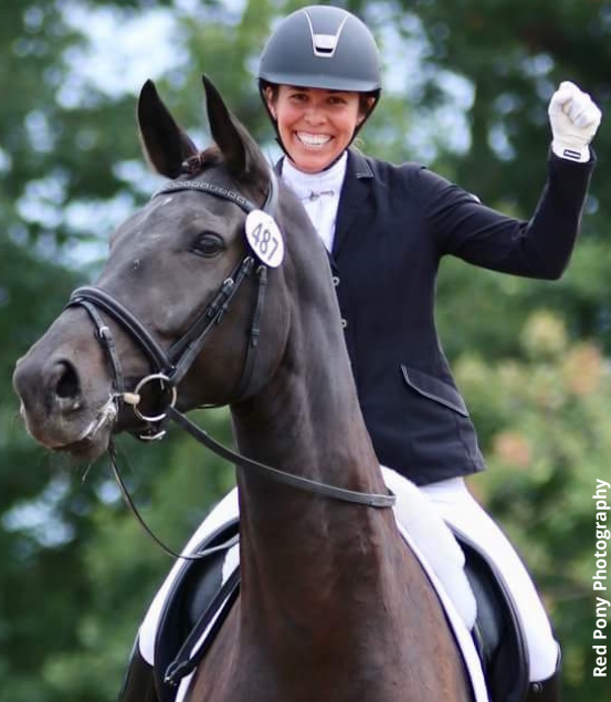
Red Pony Photography